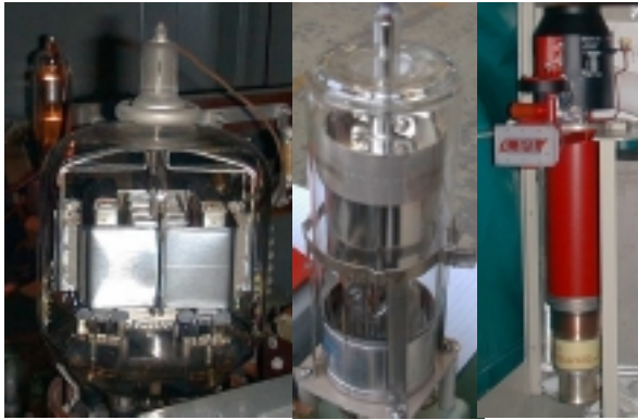
FIG. 1. Different kinds of electron valves, used in radar facilities

If a radar technician who suffers from cancer, claims his disease as occupational caused to an accident insurance, it has to be proved if the occupational radiation exposure was high enough to induce the disease substantially according to German laws. Therefore the dose has to be verified retrospectively. In the last two years there had been a lot of investigations on various radar systems by the military and civil laboratories. In this contribution an example is given for a system with higher dose rates. The discussion about the mentioned hazards put also civil technicians into a state of uncertainty about the safety of their work on radar facilities. Because today there are no older radar systems available for measurements in Germany, only current systems could be proved by measurements. An example for a measurement at the most spread civil surveillance radar system on German airports is given in this contribution, too.