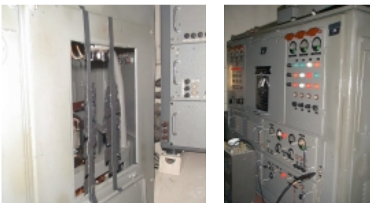
FIG. 4. Mounting of TLD's in the greater maintenance-opening and at the control panel

Many types of radar devices had been in use in Germany during the last four decades. The “GRS 9 A-M” is an example for a device with higher radiation emission, which has been investigated in January 2003. There are three different electronic valves used in this system, a Magnetron, a Tetrode and a locking-Diode, all of them working at about 20 kV. The TLD's had been mounted on the surface of this device or had been mounted on a tape in the maintenance-openings (see Figure 4). The exposure-time was 20 minutes. The detection limit of the TLD's was about 4 \mu\text{Gy} in this case, according to a minimum detectable dose-rate of 12 \mu\text{Gy/h} .