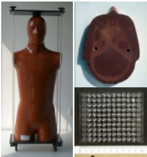
FIG. 3. Alderson Phantom with a head-disc and TLD-rods

Additional measurements have been done at this ASR-2000 with a tissue-equivalent phantom (Alderson phantom) to verify possible organ doses in different tissues. The phantom is cut into 34 discs each with several bore-holes for taking TLD-rods (see Figure 3).